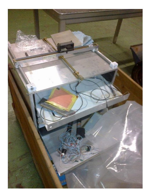
Gas and reception table already in 904.