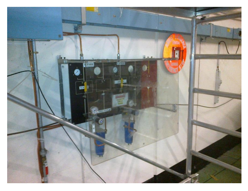
A super Module carefully installed in an old Chamber support frame.