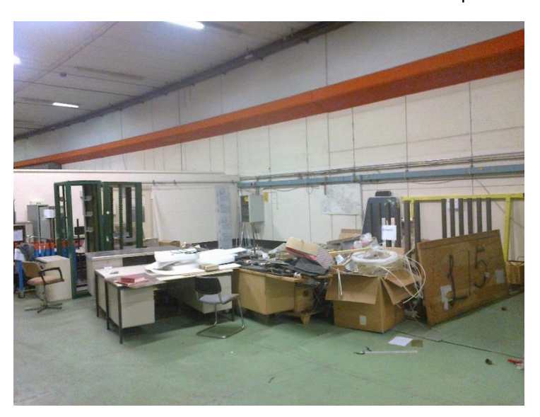
Including our Scintillators.