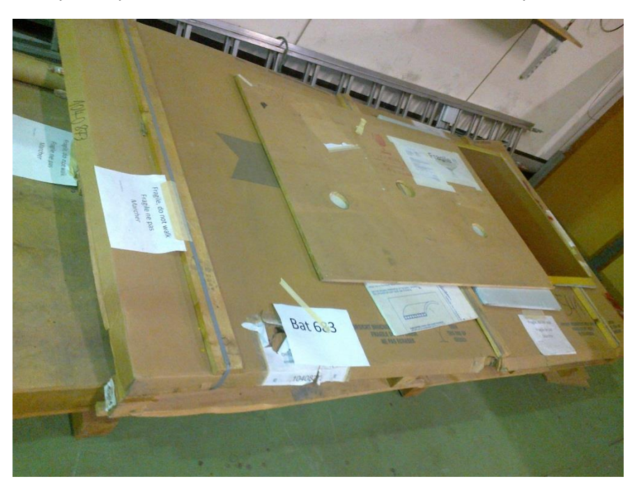
The gaps have since been thrown but the structure retained.

Honeycomb panel carbon fibre, Alu raw material and Nomex panels.