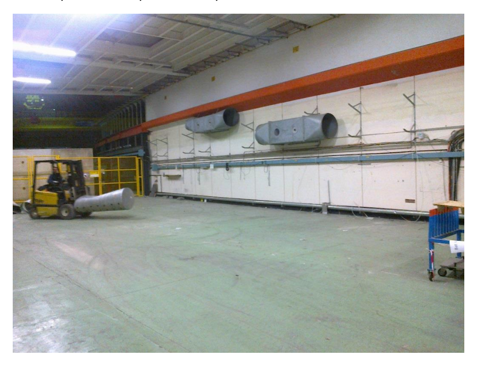
And ready to go.