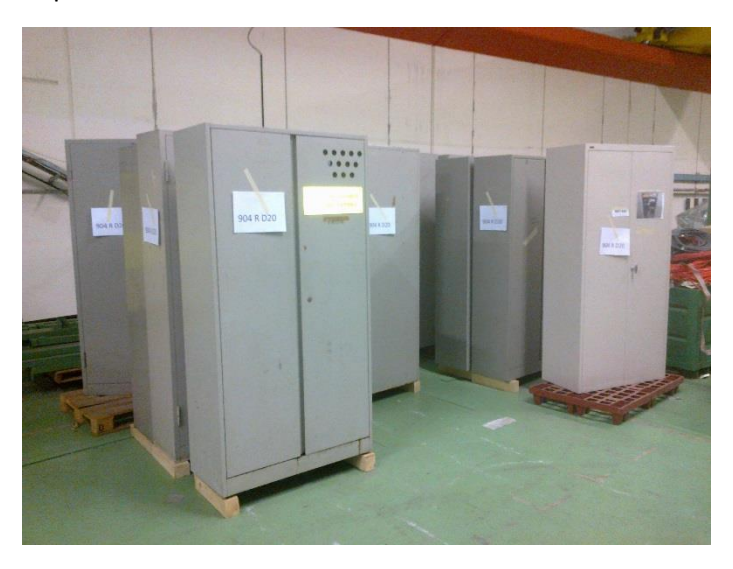
The RPC gaps on this trolley have been disposed of and the trolley kept. The cupboard with one other will go to the GIF facility,