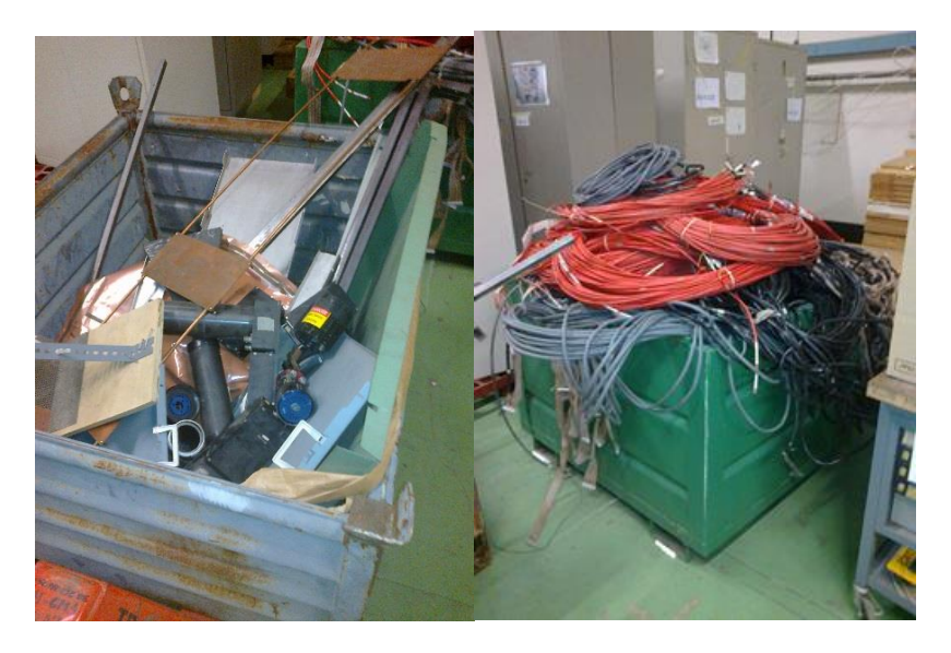
The collected material from both CSC & RPC to be disposed of.