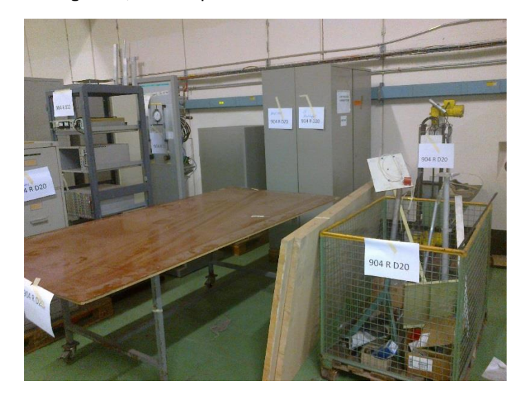
Cables for 610