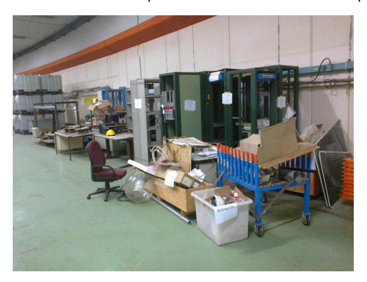
The Tent has gone.