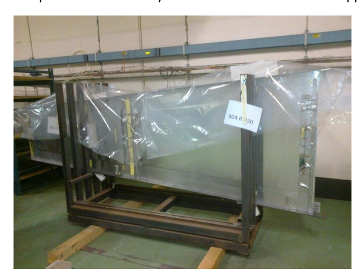
Some more for the 683 and 904.